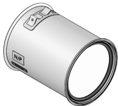
Detroit Diesel DPF

Having a fully integrated manufacturing process allows DCL to test, develop and manufacture high quality emissions treatment solutions for the aftermarket.